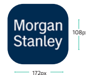
App Store Icon App Store Size: 250 x 250 px Logo: 172px by 108px