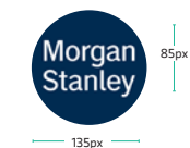
Social Profile Avatar Standard Avatar Size: 140 x 140 px Logo: 135px by 85px